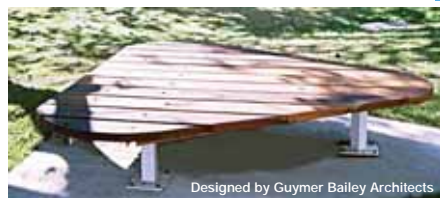
Designed by Guymer Bailey Architects