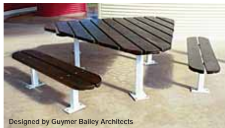
Designed by Guymer Bailey Architects

Traditional or contemporary Includes wheelchair access