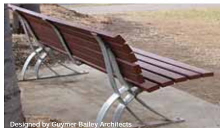
Designed by Guymer Bailey Architects