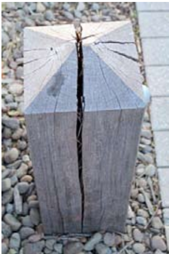
150x150 bollard split in two