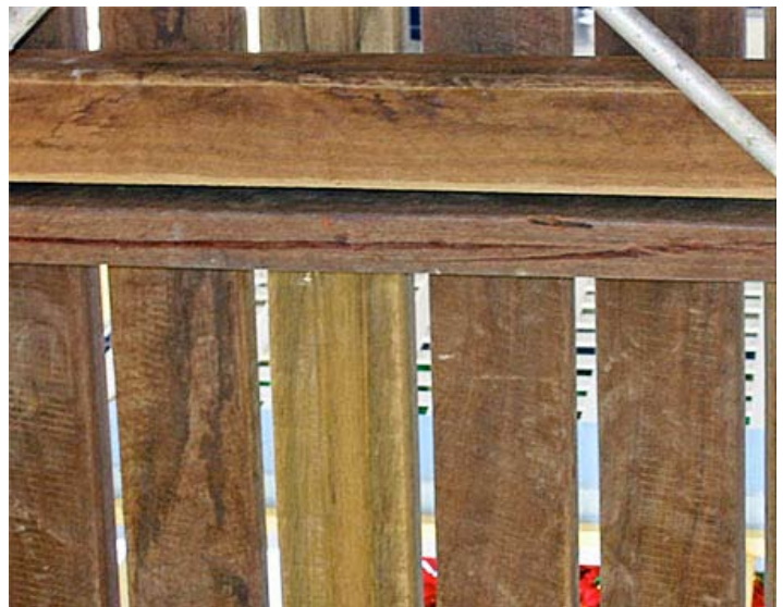
Underside of 100x50 joist. Notice the split along the length!

My competitor came along and said problem? What problem? and got the order. I would expect