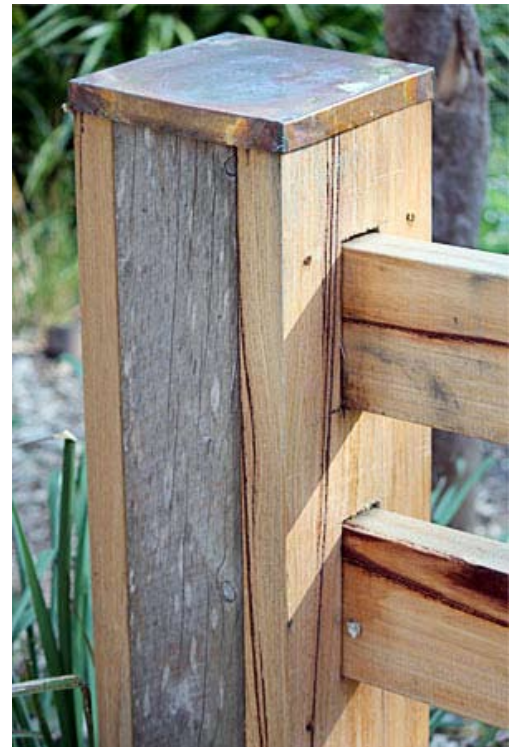
F17 KD hardwood.

With the lower grades, there is no connection between the amount of defect allowed and what designers expect to receive. The table below shows the strength of the timber by structural grade compared to that of timber without any natural feature.