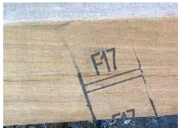
F17 brand with supplier's name removed