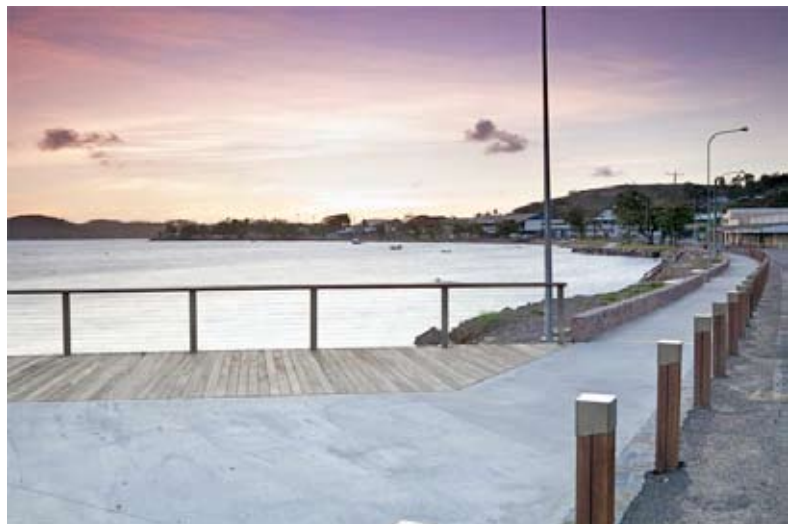
150x150 bollards used successfully on Thursday Island as detailed by OSA

When I interviewed someone for a job a while back, I told him that people that work for me tend to become religious very quickly. What do you mean, he asked. Well before too long I will hear you say Lord give me strength . When I saw the images of the split bollards at a very well known tourist attraction I had a give me strength moment. It is the same site where the F17 timber images and F11 KD Joists mentioned above are from. I could understand if the owner said we will never use timber again.