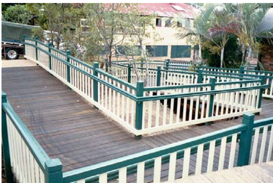
OSA's Queenslander P4 handrail system with OSA grabrail