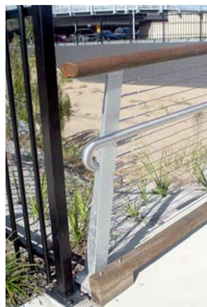
OSA C4 Bikeway rail with extra grabrail and kerb

I was asked recently how to specify timber for handrail according to AS2082. I had to think as, quite frankly, we ignore it and produce a product suitable for application. What is the correct way to do it? I tabled two species (Spotted Gum and Ironbark) in two of the best grades (F22 and F17 exposed) and compared them.