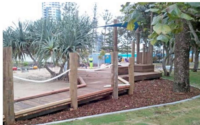
These playground posts cannot be H5 with CCA. (H5 in ACQ is not readily available)