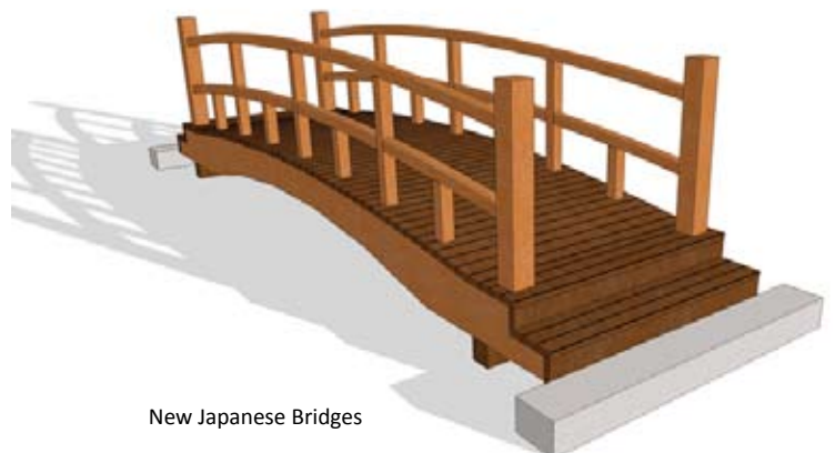
New Japanese Bridges

A brochure will soon be available for our Japanese bridges. I expect it will be part of the next newsletter. Do not hesitate to contact us beforehand.