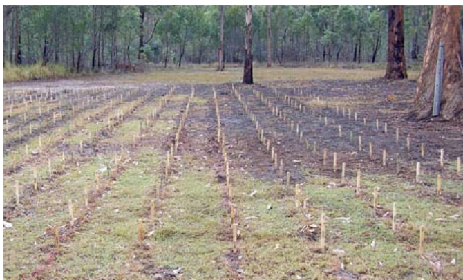
Graveyard trial to test efficacy of treatment