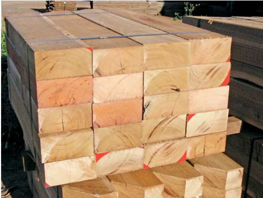
The areas in red are the only portions that will be treated

With the pole in the lead image above, it doesn't matter that you cannot penetrate the truewood with the preservative as there is a complete circle or "envelope" of preservative encasing the heartwood. If you do not put any cuts or holes through the treated sapwood the pole is "preserved". Durability through preservation is only achievable on a practical basis in natural rounds with at least a 12mm sapwood envelope.