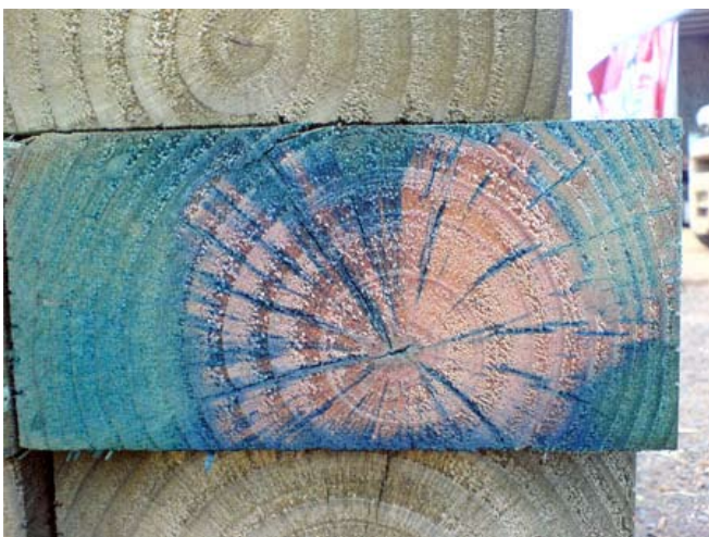
Untreated heart in pine extending full width

When you ask for H5, in practice it can only be met in hardwood in Queensland with CCA. Now who is going to accept CCA these days for human contact? (Treatment to H5 with the alternatives is theoretically possible but not easily commercially available). Sometimes you have to do a “work around”. The playground illustrated has handrail posts that go into the ground, a H5 (CCA) application which you cannot do. Our work around was to use Durability 1 in ground timber and measured the required diameter under the sapwood i.e. a 200mm post became a 225mm post’.