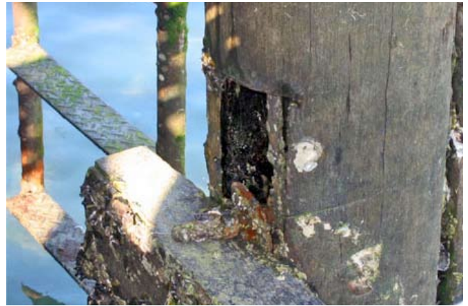
Envelope protection broken by notch and bolt