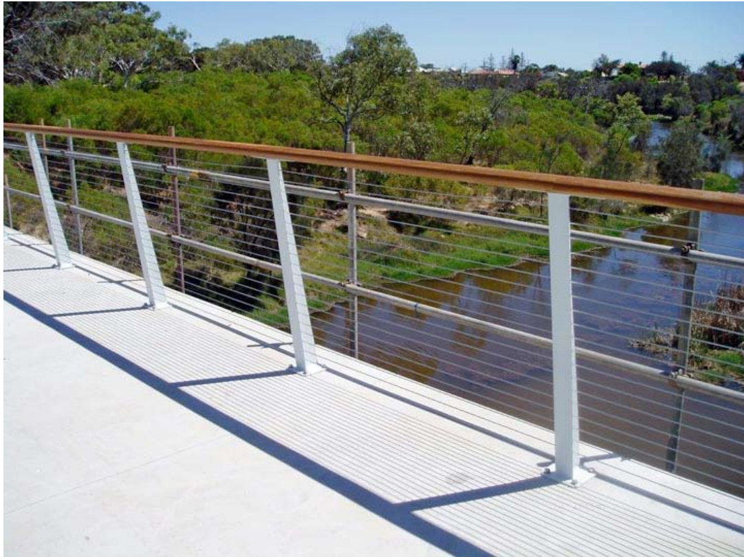
C4 Handrail recently installed near Geraldton