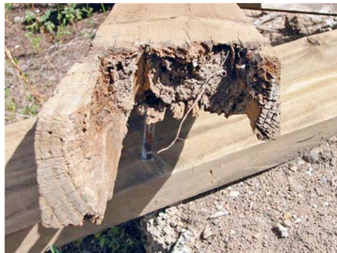
Heart has decayed leaving outer treated sapwood