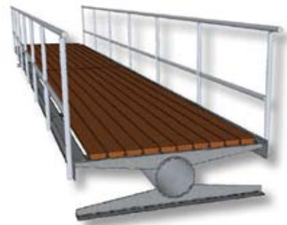
One of the possibilities of the Somerset Bridge