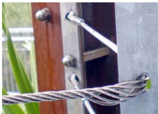
How not to change direction with wire ropes

Refer to pages 24 and 25 of the Commercial Barrier guide, follow the link below.