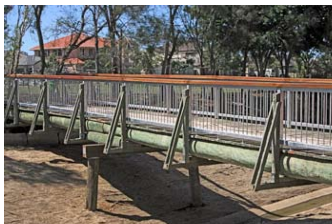
New (left) and refurbished bridge (right) by OSA with P7 Barrier