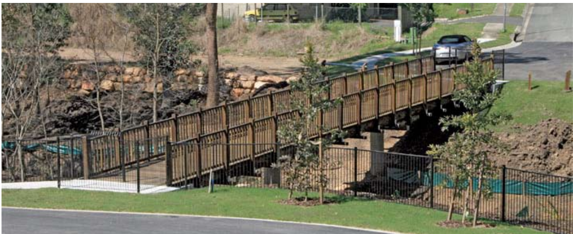
Log Bridge with P5 Barrier

This bridge, with an overall length of 25.6m incorporates two spans at 8.3m and 1 at 9.0 m. The handrail is P5 (minus the grabrail) from our Commercial Barrier Guide. The Client is extremely happy. More images can be seen by following the link below