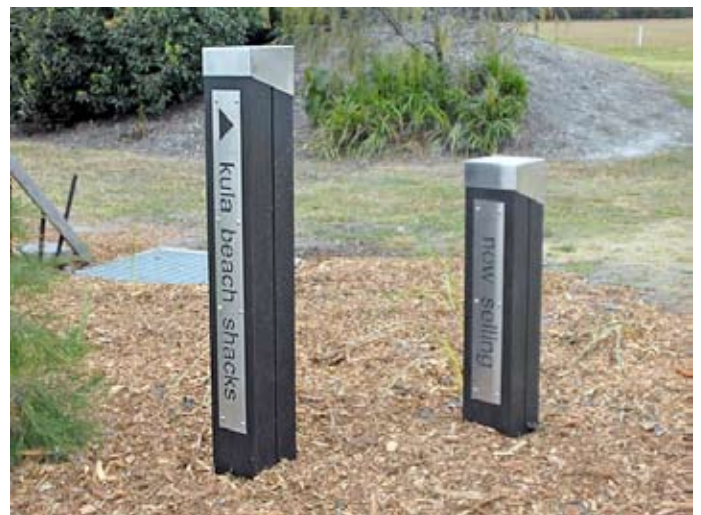
Outdoor Structures Australia Pioneer post