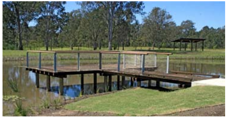
Deck using P8 Handrail

http://www.outdoorstructures.com.au/gallery.php?gid=101&SID=5