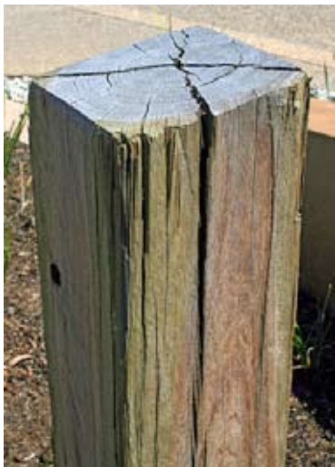
Standard 200x200 recycled

Last month, when I sent out the newsletter (via email), I did the unthinkable, I attached the wrong file. You received an earlier version of the September Newsletter which was much shorter than the one I planned to send. Rather than burden you with a second September Newsletter I thought it better to "burden" you with a longer one in October. The beauty of the hyperlinks is that you only need look at what interests you.