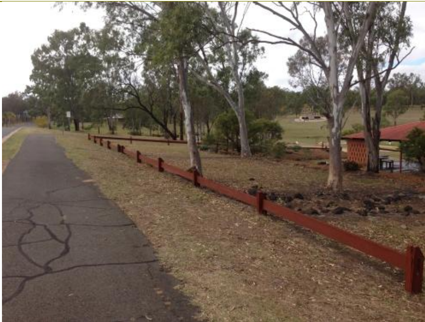
Broken plastic bollard and Intact hardwood traffic barriers in a park opposite my home