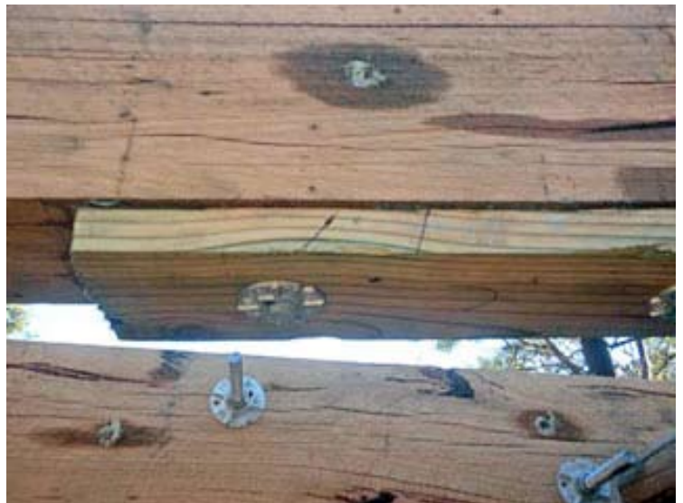
Cross head retrofit with Kevlar