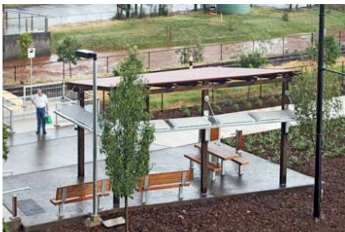
Flood proof OSA shelter in Toowoomba

The shelter on the right is a custom shelter we designed and built for Toowoomba Regional Council and was in the thick of the flooding this year. It came through unscathed. When we say our products “Outlast and Outperform” it is not hype. If you have forgotten how extreme the flood was, the youtube link was taken a short distance upstream from our shelter.