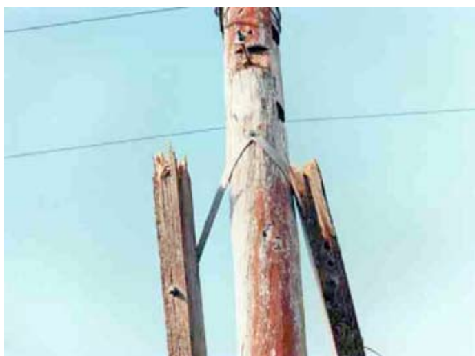
Possible consequence of edge clearance not being maintained

I was reminded recently of the importance of maintaining bolt edge clearances. The picture on the left shows a newly installed 150x100 crossarm mounted on its edge on a pole, i.e. the 150mm face is up. A 20mm bolt passes through the 100mm face. This is common practice with crossarms. The edge clearance required for a perpendicular load, which this is, is 3 bolt diameters i.e. 3 \times 20\text{mm} = 60\text{mm} .