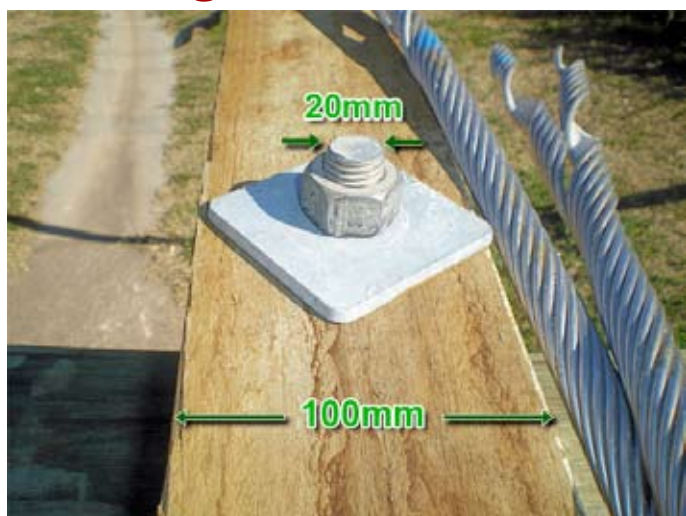
Edge distances are not maintained