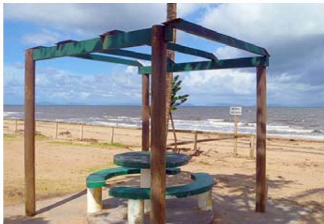
Not quite so robust shelter by others